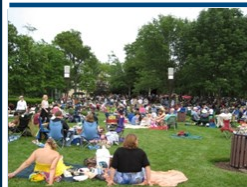
In Our Garden!